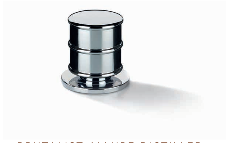
BRUTALIST ALLURE DISTILLED

Based on the old oil drum barrels littering our industrial landscapes, the design for the Orkney came from finding beauty in the most unlikely of locations.