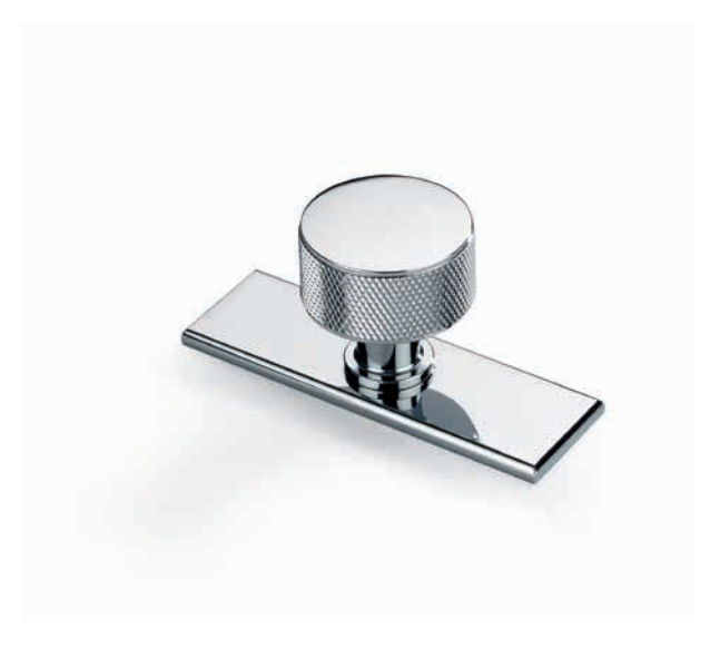
CROFTS & ASSINDER BACKPLATES

Designed to fit our most popular ranges, our backplates add a hint of modern elegance; the perfect finishing touch to elevate your handles to another level.