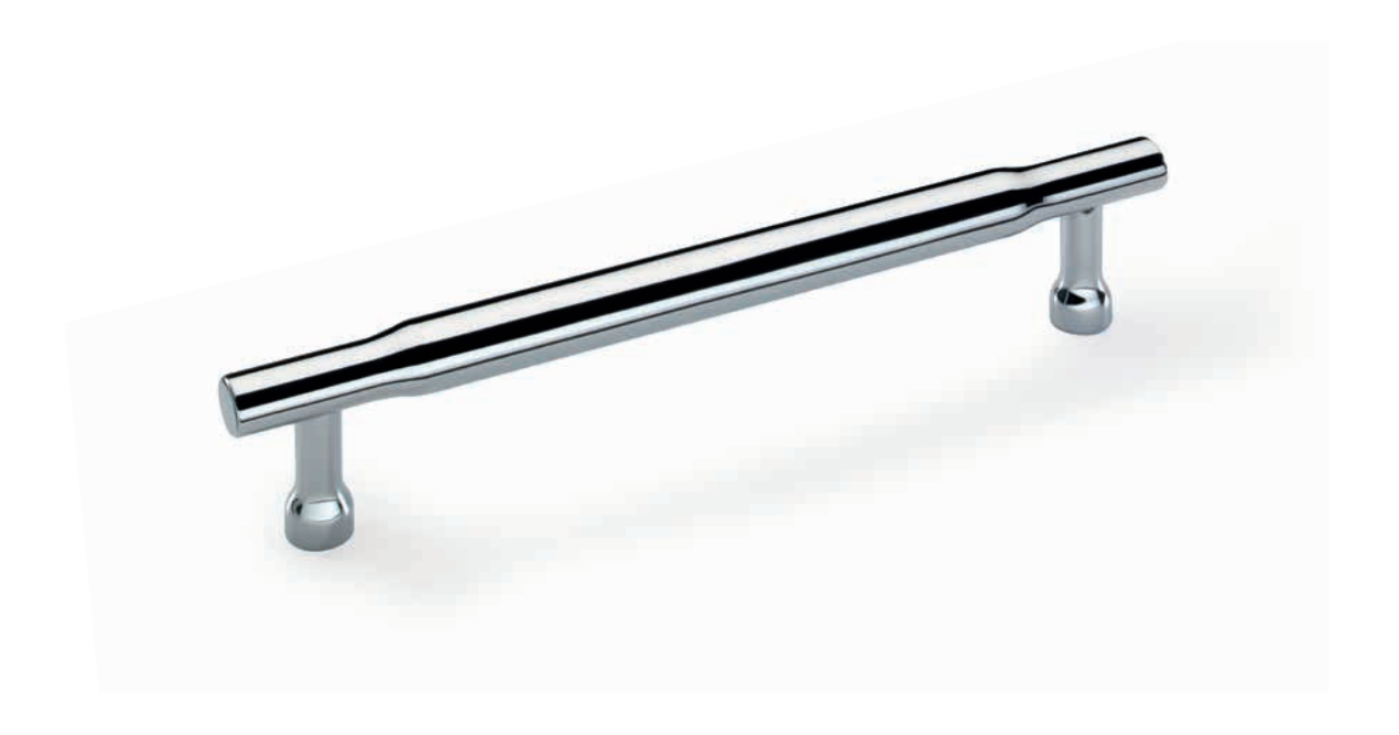
FUNCTION IN ITS FINEST FORM

Implementing traditional Shaker values, humble undulations represent strength and humility as well as pure craftsmanship.