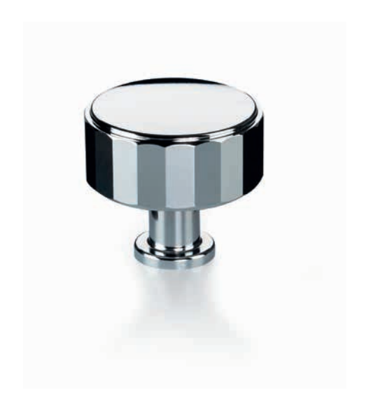
A SHOWSTOPPER WITH CLASSICAL FLAIR

Inspired by light refraction on multi-faceted gemstones, this bewitching handle blends art-deco allure with avant-garde styling to create a jewel of a range.