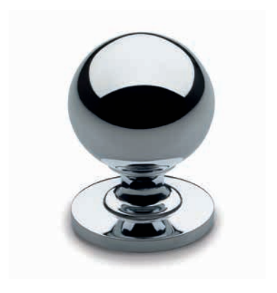
Knob KB-B-4015 W/D33 H/P44

Standard Finishes: Chrome, Brushed Satin Nickel, Polished Nickel.