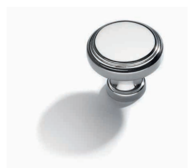
THE EPITOME OF NATURAL PERFECTION AT ITS PUREST

Soft echoes of the endless, elegant circles of gently rippling water. Delicate, desirable, enduring.