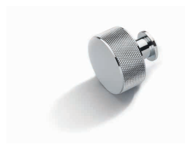
THE INDUSTRIAL AGE MEETS THE NATURAL WORLD

Drawing its inspiration from the gently knurled seeds of the centre of a sunflower on a summer's day. Sensual, sleek yet strong.