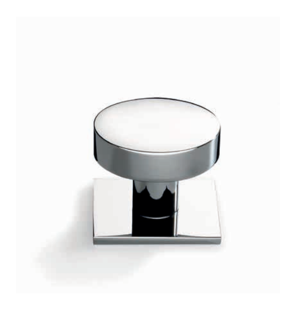
THE DEFINITION OF ELEGANCE

Inspired by the beauty and style of the Bauhaus movement, the expansive face of the Cambridge is extravagant yet simplistic, adding a touch of luxury to any home.